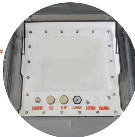
Tank Manway: Recessed Spill Box Area *Layout may change with product evolution.

*Denotes the face that the Pump Bay is located on.